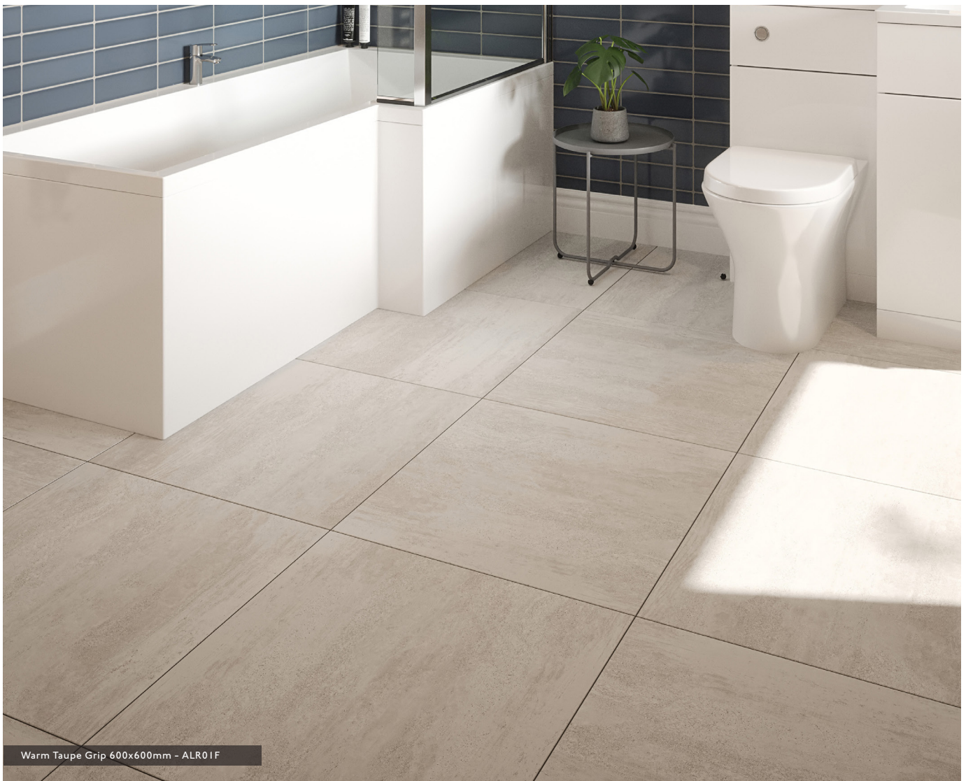
Warm Taupe Grip 600x600mm - ALR01F

Note: Glazed Ceramic / Blll and Glazed Porcelain / Bla tiles. For more information please see the suitability advice given in the technical section. All sizes indicated are metric modular. All sizes shown are nominal. For the most up-to-date size, colour and finish availability, please visit our website - www.johnson-tiles.com . (R) Rectified Edge.