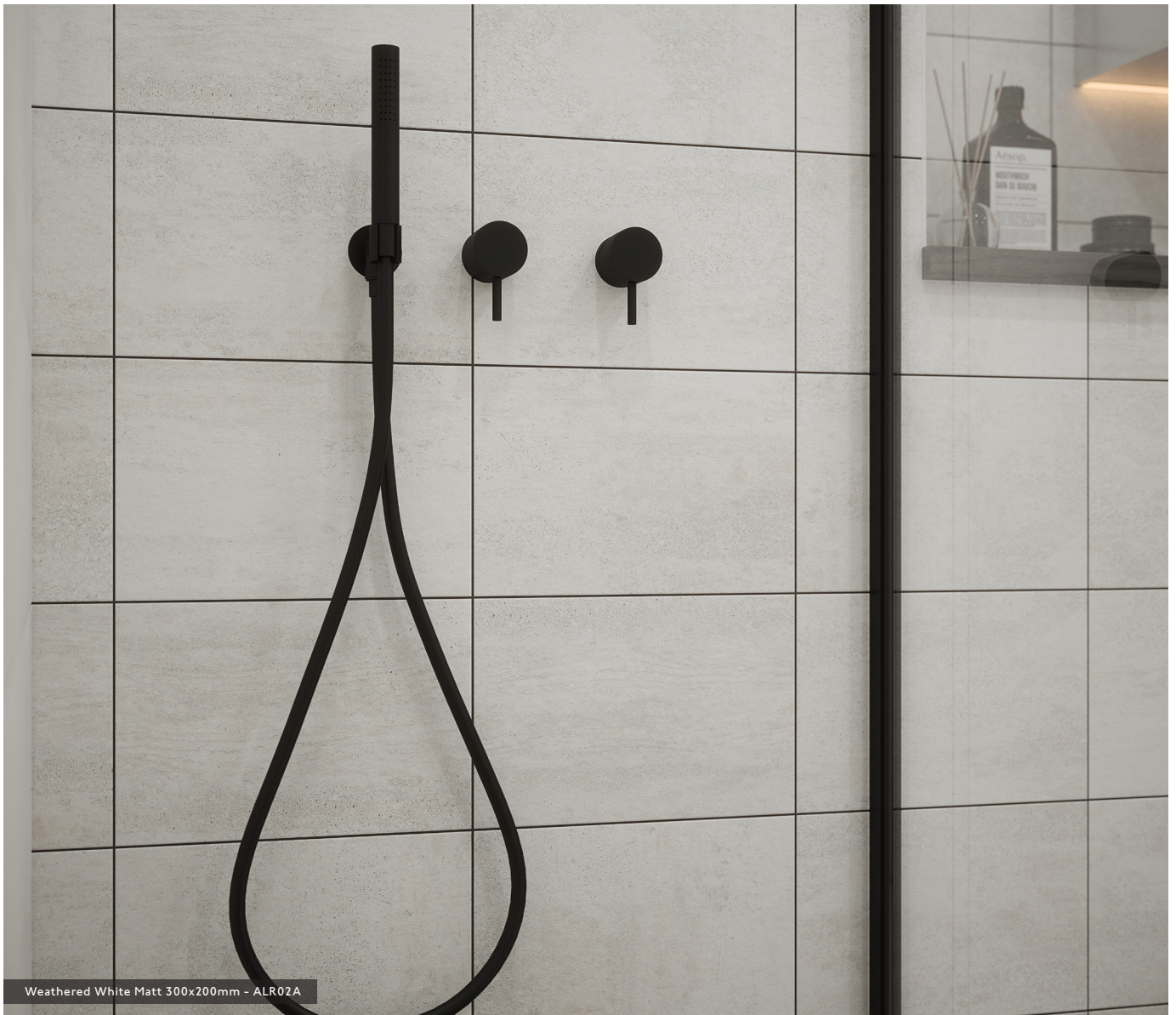
Weathered White Matt 300x200mm - ALR02A

All product technical values quoted in this literature are supported by laboratory testing from our own and independent ceramic test houses. Johnson Tiles Limited are British Standard registered. To find out more, please contact our technical advice helpline on +44 (0) 1782 524 111 or email: technical@johnson-tiles.com .