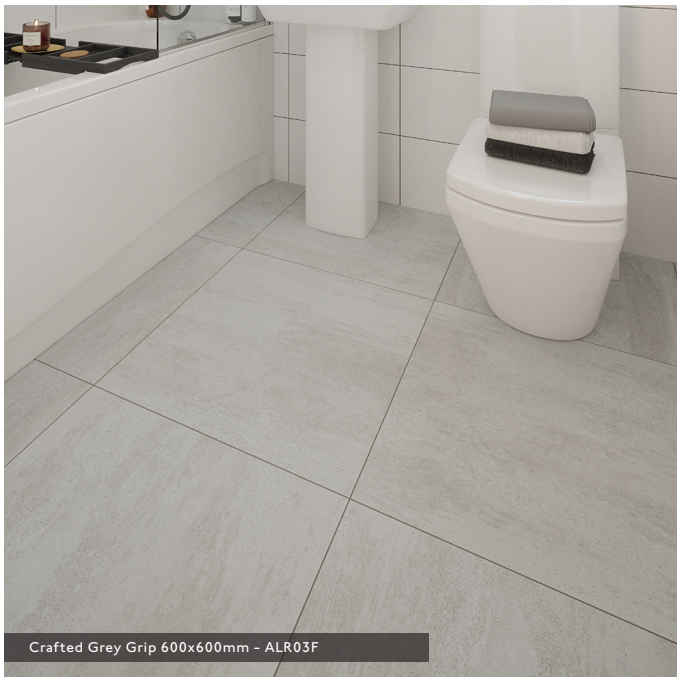
Crafted Grey Grip 600x600mm - ALR03F