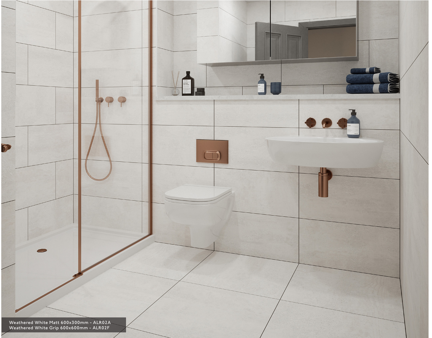
Weathered White Matt 600x300mm - ALR02A Weathered White Grip 600x600mm - ALR02F