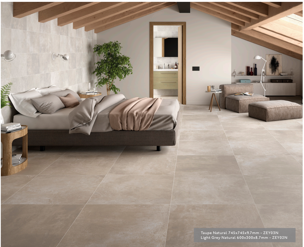
Taupe Natural 745x745x9.7mm - ZEY03N Light Grey Natural 600x300x8.7mm - ZEY02N

Note: (R) Rectified Edge. Class Bla: Glazed Porcelain Tiles. For more information please see the suitability advice given in the technical section. All sizes indicated are metric modular. All sizes shown are nominal. For the most up-to-date size, colour and finish availability, please visit our website - www.johnson-tiles.com .