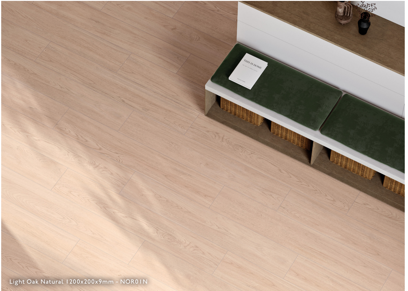
Light Oak Natural | 200x200x9mm - NOR01N