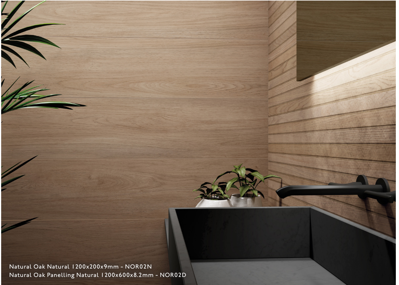
Natural Oak Natural | 200x200x9mm - NOR02N Natural Oak Panelling Natural | 200x600x8.2mm - NOR02D