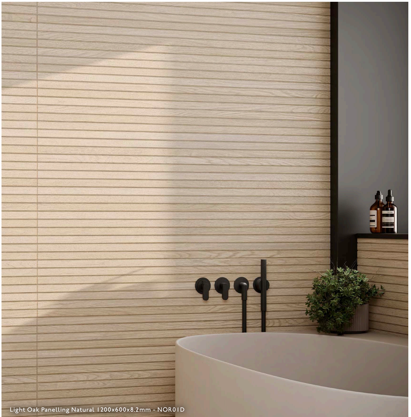
Light Oak Panelling Natural 1200x600x8.2mm - NOR01D