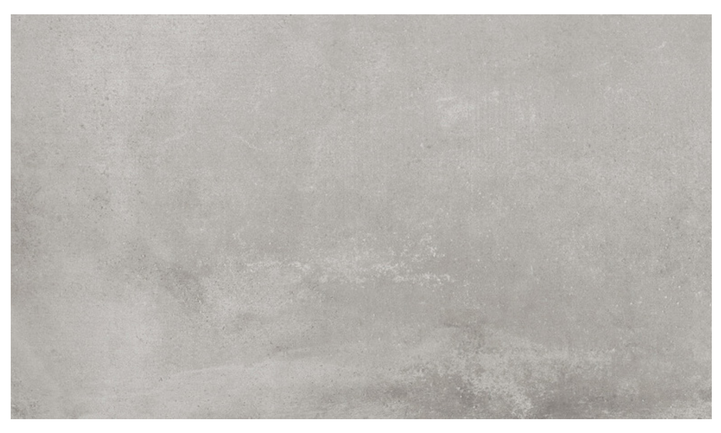
PUMICE PEI: IV LRV: 29 Product Code: N ATRM3N + G ATRM3G Mosaic Code: N ATRM3M Fitting Code: N ATRM3S