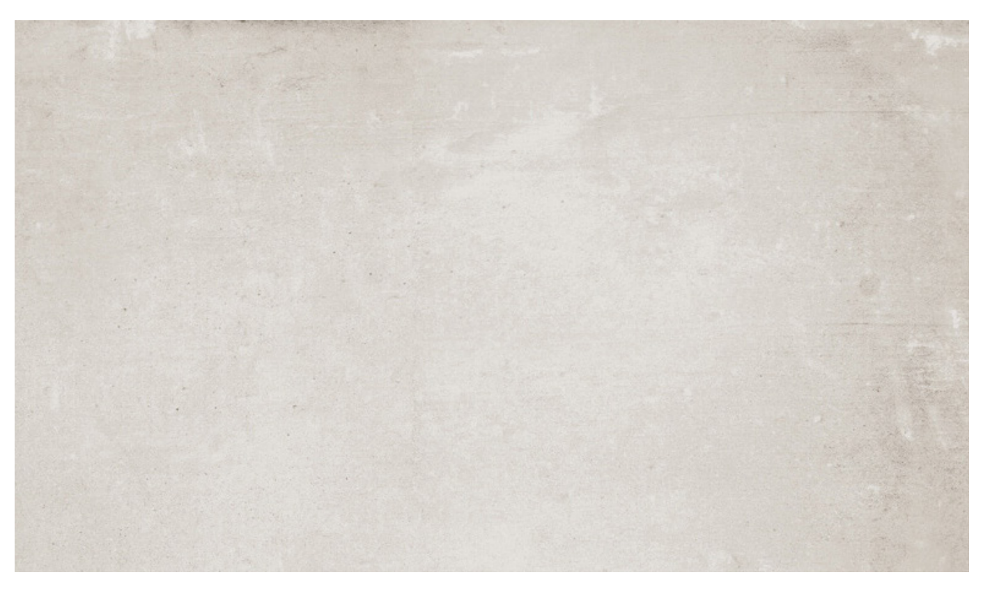
CLAY PEI: IV [LRV: 40] Product Code: N ATRMIN + G ATRMIG | Mosaic Code: N ATRMIM | Fitting Code: N ATRMIS