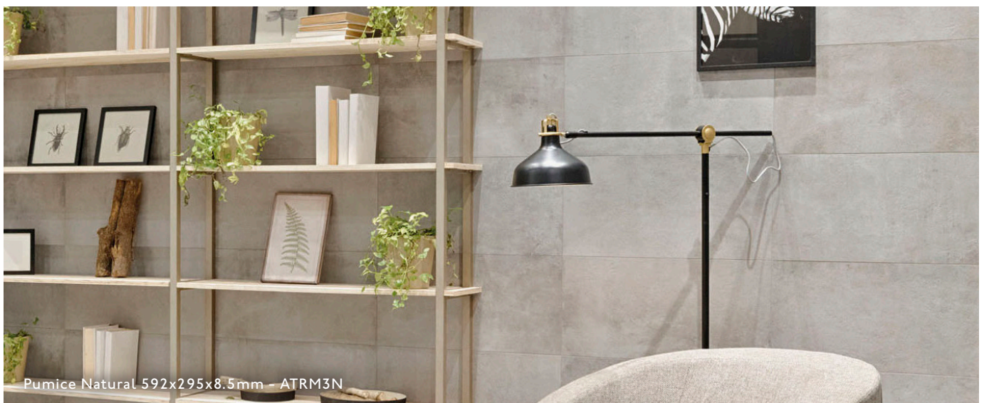
Pumice Natural 592x295x8.5mm - ATRM3N

Note: Glazed Porcelain / Bla tiles. For more information please see the suitability advice given in the technical section. All sizes indicated are metric modular. All sizes shown are nominal. For the most up-to-date size, colour and finish availability, please visit our website - www.johnson-tiles.com . (R) Rectified Edge.